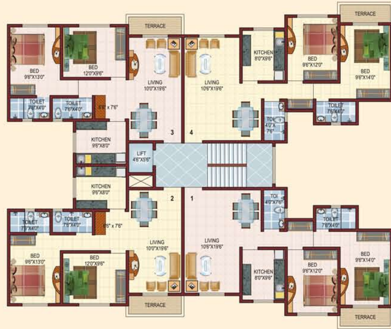
WING D THIRD, FIFTH & SEVENTH FLOOR PLAN