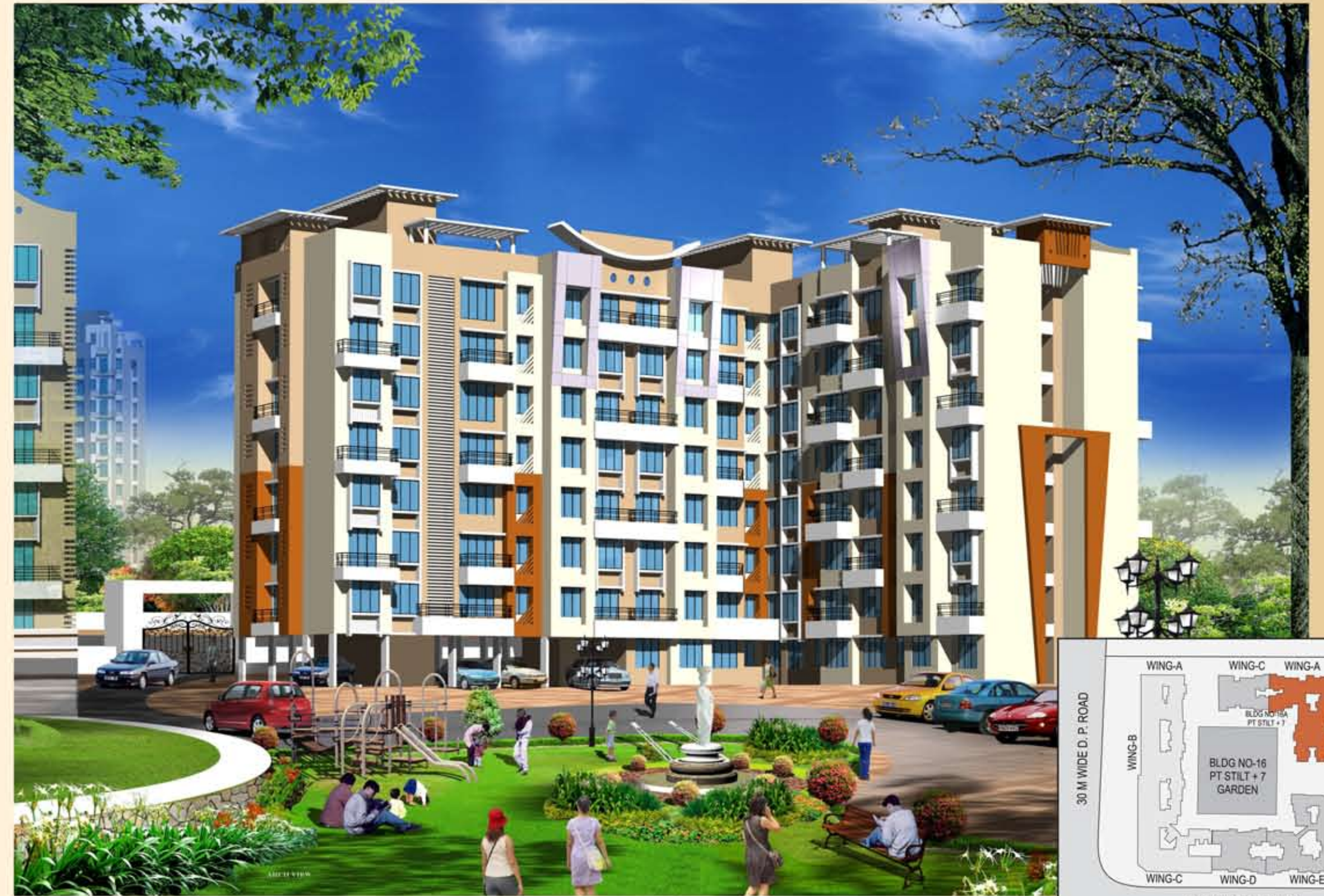
Kingston Annex (A & B Wing) 2 BHK FLATS