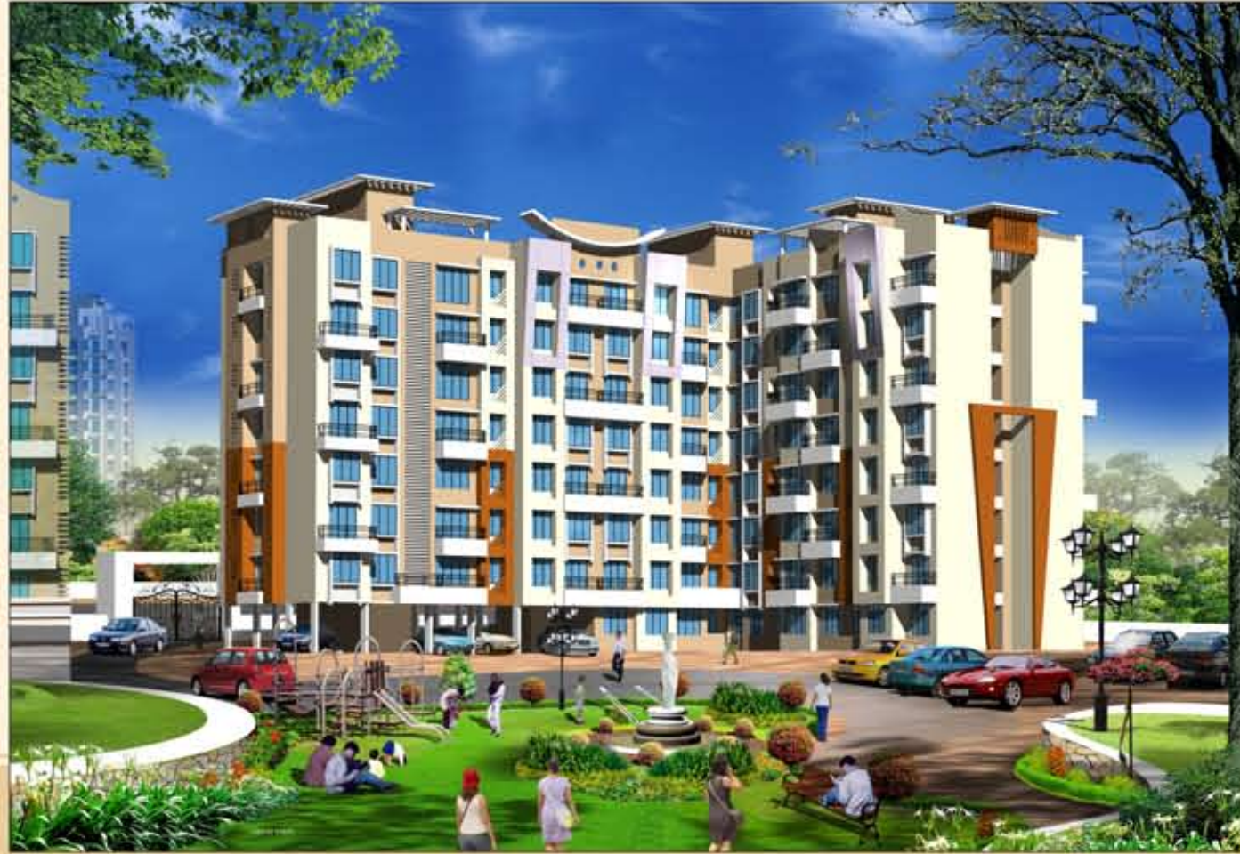
Site : Kaul's Heritage City, Opp. Navjeevan Hospital, Bhabola Naka, Chulne, Vasai (West). Contact : 98202 17767