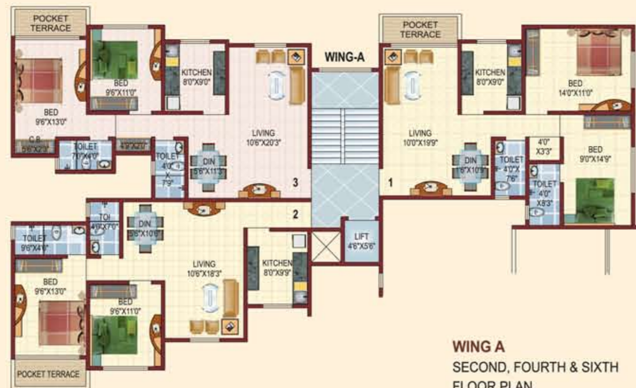
WING A SECOND, FOURTH & SIXTH FLOOR PLAN