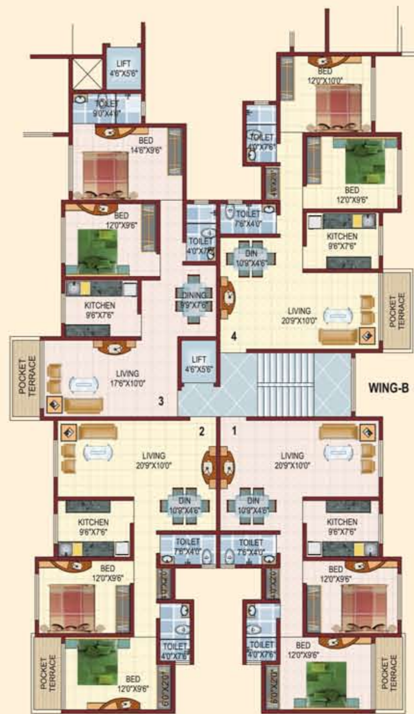
WING B THIRD, FIFTH & SEVENTH FLOOR PLAN