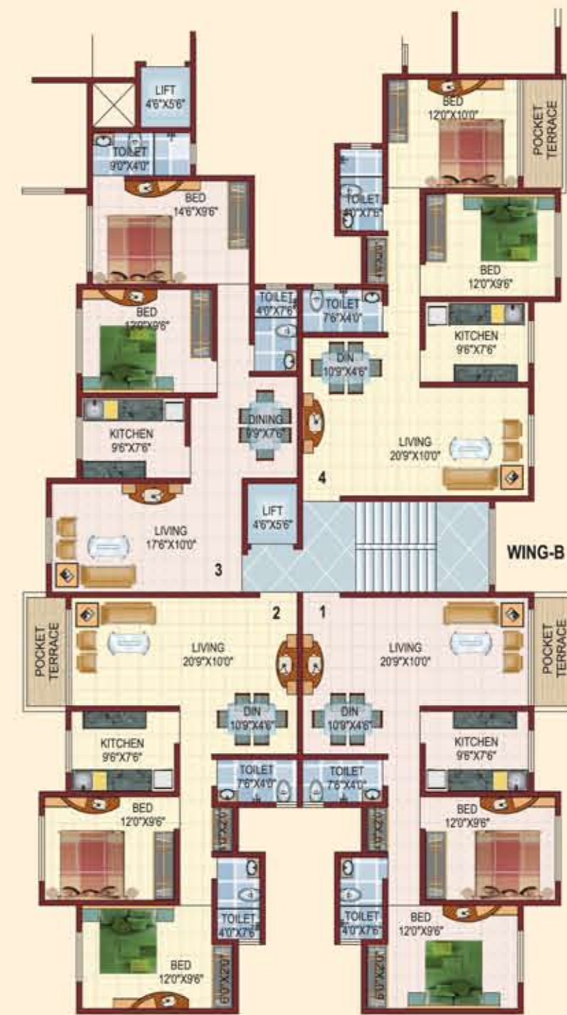
WING B SECOND, FOURTH & SIXTH FLOOR PLAN