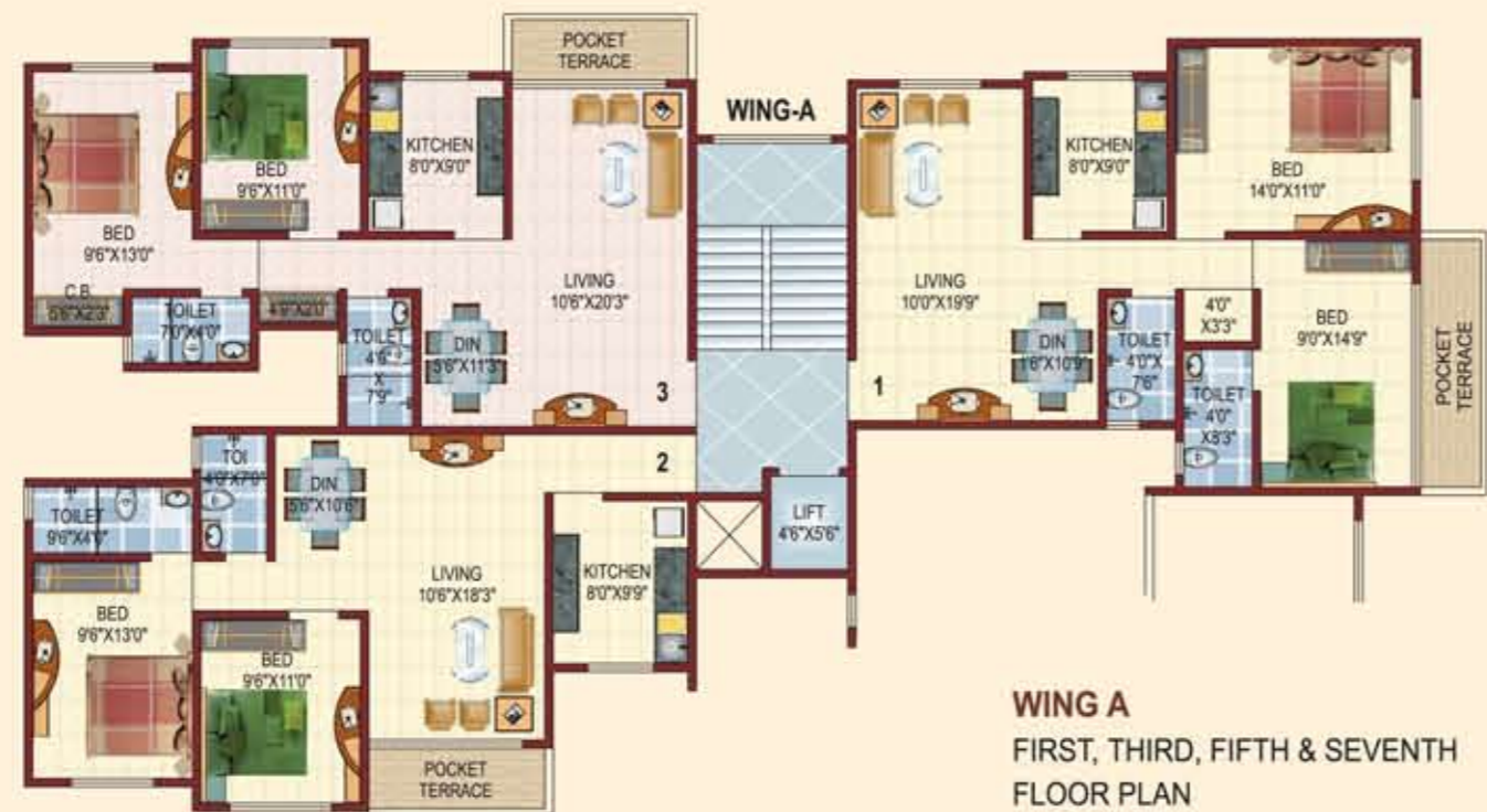
WING A FIRST, THIRD, FIFTH & SEVENTH FLOOR PLAN